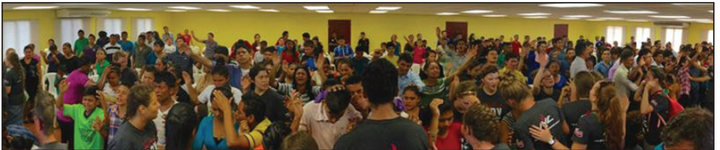
MASTHEAD PHOTO: 2015 Apostolic Youth Corps (AYC) members minister at a service in Nicaragua.